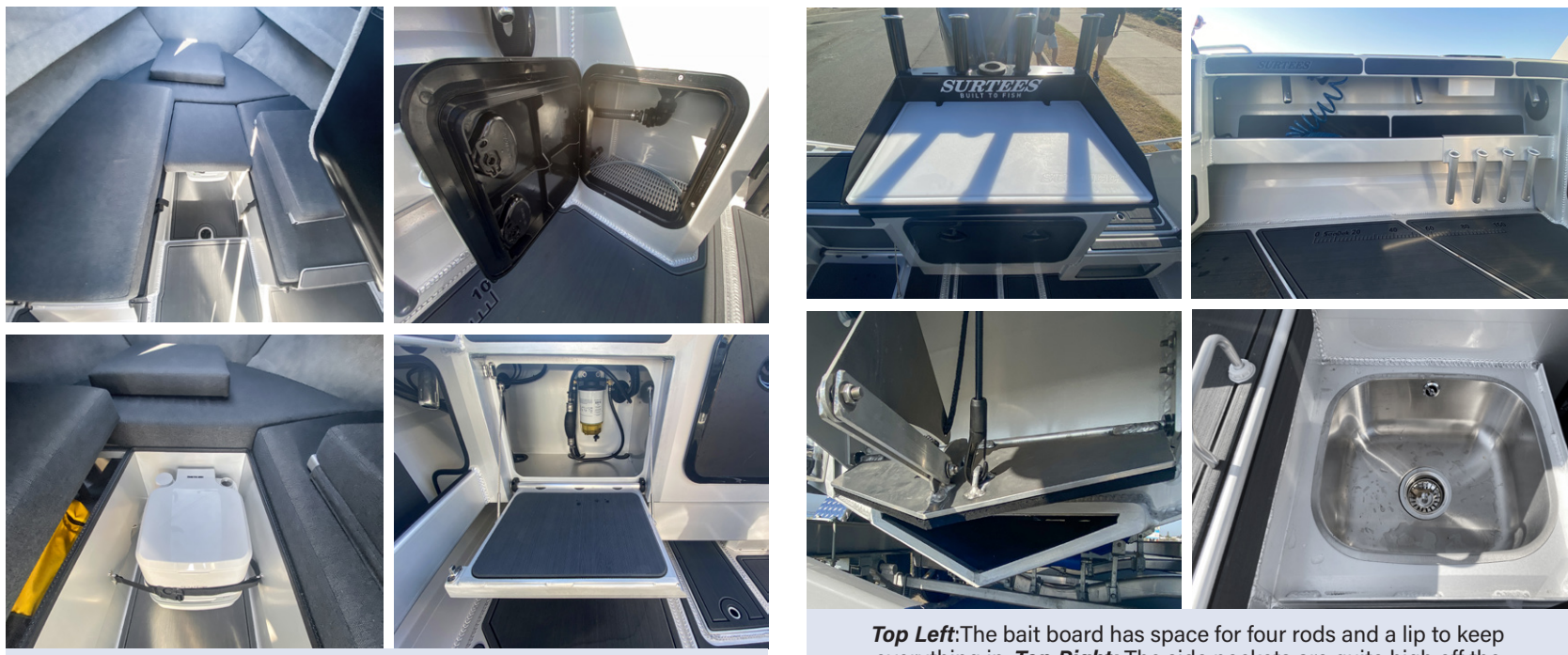
Top and Bottom Left: There's ample cabin space for overnighters, which includes a chemical toilet under the infill. Top and Bottom Right: Standard access hatches allow you to access all plumbing.