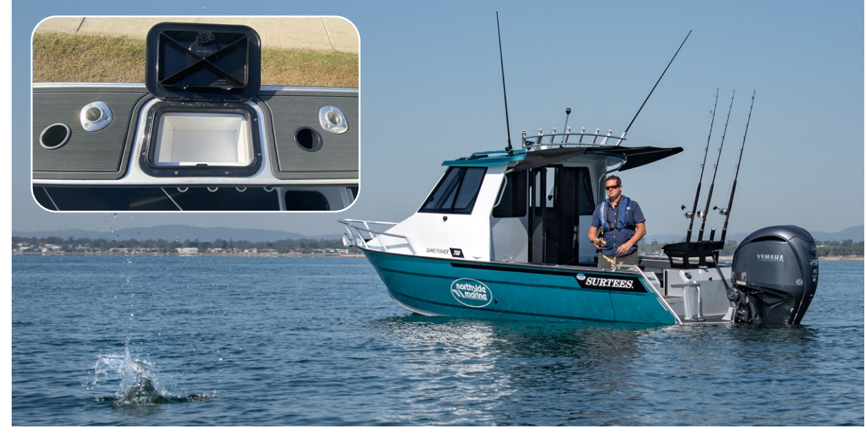
Above: All of the fishing space is in the cockpit and it's definitely built to handle water nastier than this. Inset: This is the first boat I've seen gunwale mounted boxes in. Brilliant for tackle storage that you need close to hand.

trailers, removing the risk to customers of importing themselves.