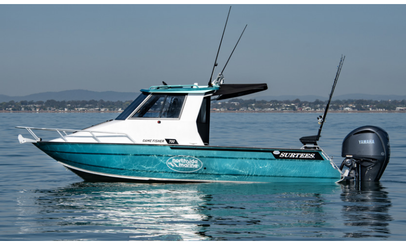
Top: Peak efficiency for this rig is at 3,700rpm where it delivers 1.6km/L at 43km/h. Punch the throttle and you get only 0.8km/L at 6,000rpm and 77km.h. Above: The Surtees Game Fisher 700 beautifully balanced at rest.

For'ard of the cabin doors, the luxury continues. There is a sizeable cabin, which will allow multiple this model outboard. anglers to enjoy an overnighter,