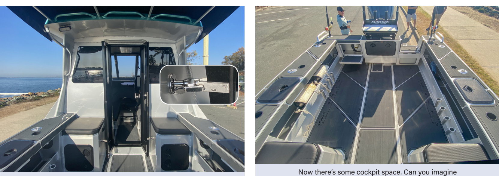
shut, depending on the weather conditions.