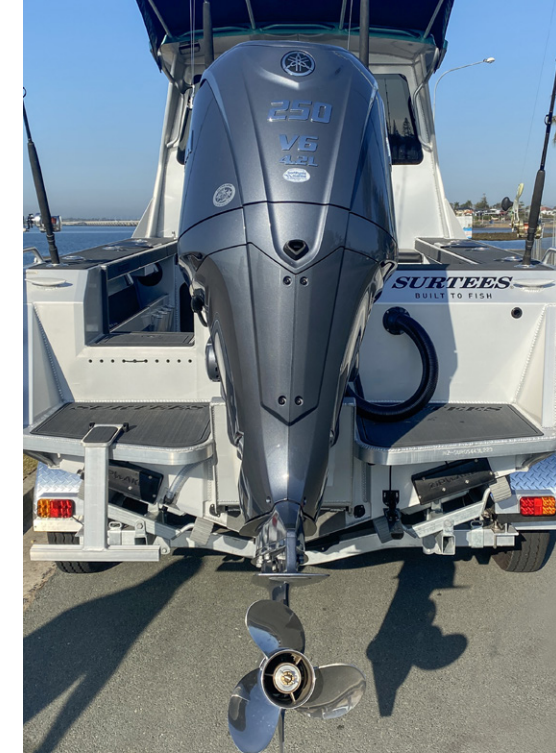
Yamaha's DES models have ultra-simple rigging and are available in blue or white.