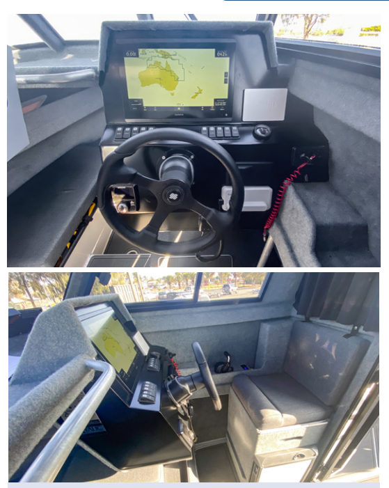
Top: We love the room for big, flush mounted MFDs at the helm. The Surtees helm is custom built to hold everything you'll want to fit - including the rest of the Helm Master options if you want them. Above: Big windows that open from the front help air circulation massively.