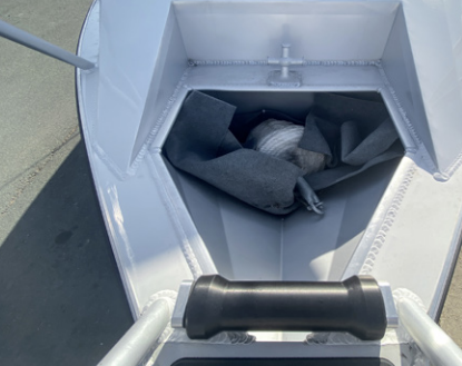
Top: Surtees treatment of the boarding step problem is sturdy, simple and convenient. Above: Plenty of room in here for the windlass.