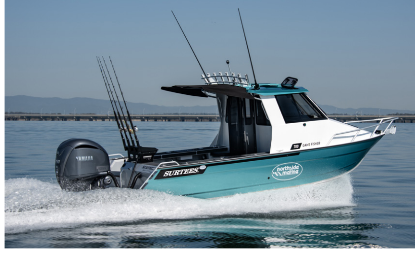
Main: There's no doubt that the Surtees 700 Game Fisher is a great looking rig. Above: It is fitted with Yamaha's Digital Electric Steering (DES) 250hp outboard, which is plug and play with Yamaha's Helm Master joystick and auto pilot system.

And it's not just the cool colour. New Zealand boats are typically very well-made and have all of the additions that a serious boatie and angler would want. Northside Marine import these hulls and then add them to locally built